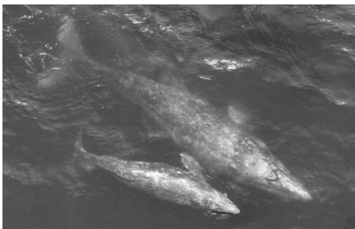
Above: One of the dozens of high quality aerial images taken this year of gray whale mothers and calves passing Piedras Blancas. Photo courtesy NOAA/ Southwest Fisheries Science Center. .