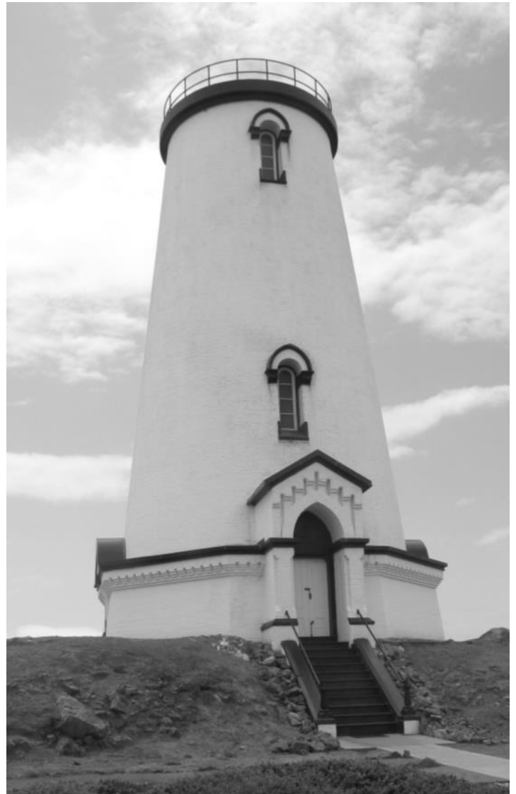
Above: The Piedras Blancas lighthouse proudly stands on a rocky knoll in silent testimony to the significance of lighthouses as aids to navigation and to the hard work of light keepers everywhere. The visibility of the lighthouse from Highway One, and the scenic location, make it one of the most photographed lighthouses in California.

On September 1991, the lighthouse, fog signal building, and oil house were certified by the National Park Service as being entered in the National Register. Around 2010, the former fuel and storage building (now gift shop) was added to the Register.