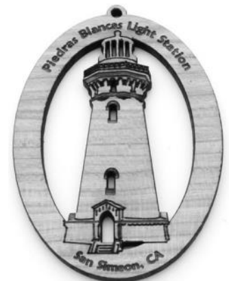
At right: A custom carved wooden ornament of the lighthouse is a new item in the gift shop..

Did you know we have an online gift shop? It is a convenient way to buy a special gift for a lighthouse lover or purchase an engraved brick. You can also become a member of the Piedras Blancas Light Station Association online or renew your membership at www.piedrasblancas.org .