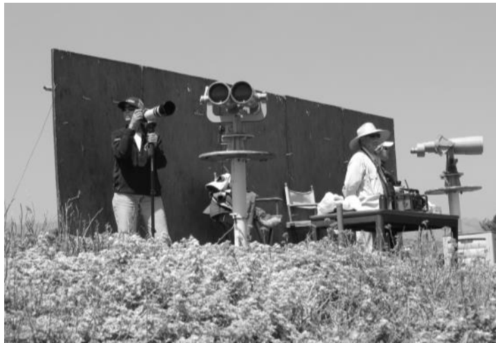
Above: Biologists from the Southwest Fisheries Service scan the waters south of Piedras Blancas during April and May for approaching gray whale mothers and calves.

Left: A mountain of paperwork was generated in order to receive permission to use this hexacopter for research purposes at Piedras Blancas. The use of drones over National Marine Sanctuary waters is prohibited without special permit.