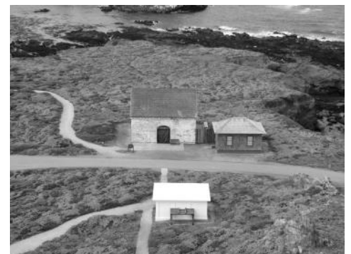
Removal of non-native vegetation and native plant restoration 2002-2010.