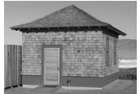
Blacksmith shop/watch room replicated in 2010, now used for interpretive purposes.