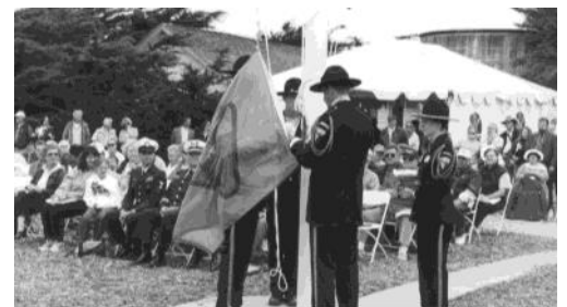
BLM flag being raised BLM Honor Guard at the Transfer Ceremony, 2002