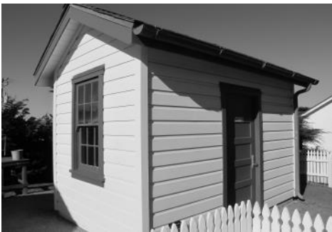
Laundry building replicated in 2008, now houses main electrical panels.