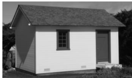
Cottage storage shed replicated in 2012, for public safety communication equipment