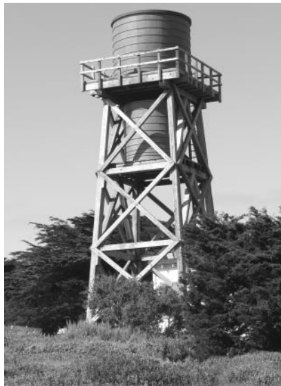
Replication of elevated water tower, 2013 for public safety communication