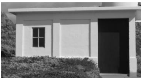
Fuel oil house restored in 2010, now used for interpretive purposes.