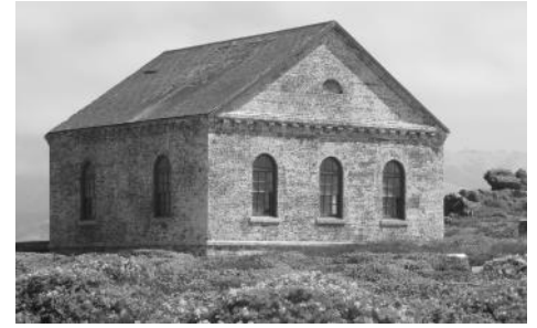
Fog signal building restoration in progress 2010-2014, partially complete.