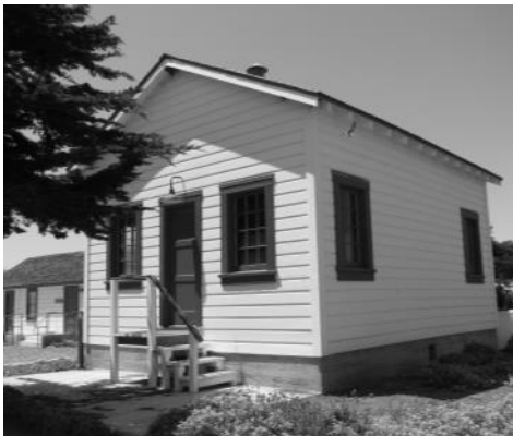
Tank house restored in 2008; holds water tank.