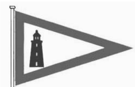
U.S. Lighthouse Service pennant was used on light service vessels, not at light stations.

A common question is, "Who manages the light station?" The Piedras Blancas Light Station has always been managed by the federal government, although the specific agency changed over the years. The lighthouse was constructed under the Lighthouse Establishment, which morphed into the U.S. Lighthouse Service. In 1939 the United States Coast Guard assumed management of all lighthouses, light stations, and light ships. In 2001 the U.S. Coast Guard transferred the helm to the Bureau of Land Management. One of the first things the BLM did was go to the public to find out what the people wanted to see happen at Piedras Blancas Light Station. The replies fell into three categories: restoration, structured public assess, and continuation of site specific research. Preservation, restoration, protection, and accurate interpretation are fundamental principles of management at the light station.