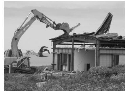
Removal of old office and garage in 2010..