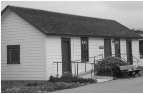
Old storage building restored in 2008, now used as gift shop and visitor center.