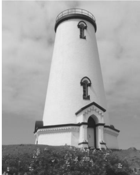
Removal of lead based paint and repainting of lighthouse, 2012.