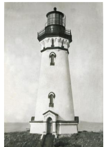
Restoration of the lighthouse and replication of the upper three levels is being studied.